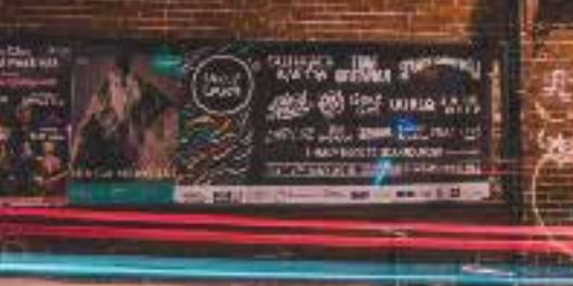
Opp Hyde Park Cinema LS6