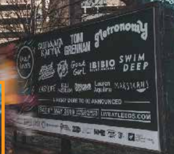
Queen's Square LS2