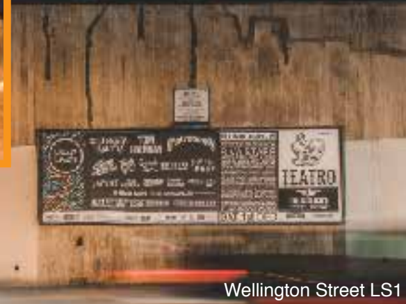
Wellington Street LS1