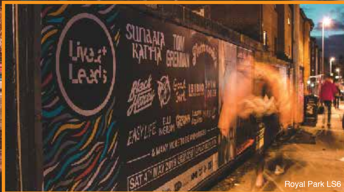
Royal Park LS6